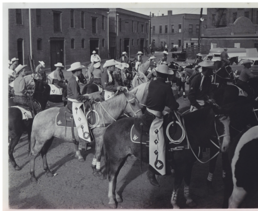
Above: The paddock outside the Stockyards Stadium, Annual Show 1956.

The Barn Superintendent will provide you with a stall and a stall card. The stall fees will be approximately $20.00 for the entire weekend. Please bring your own feed and any necessary supplements and tack that you may require.