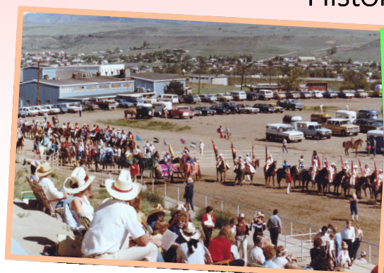
(Left) Teams line up in the Rodeo Arena paddock at the 1984 White Olympics.