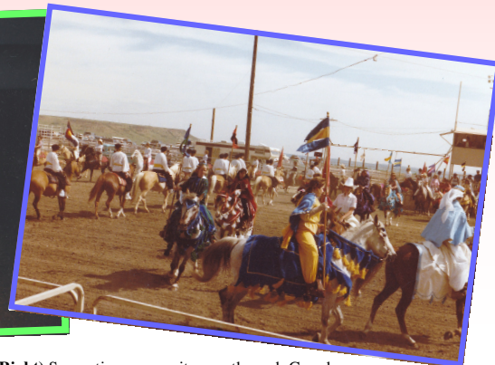
(Right) Serpentine weaves its way through Grand Entry at the 1984 White Olympics. Those elaborately-clad riders in the foreground are the Bedouins team.