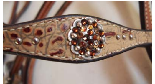
A close-up of the beautiful show tack donated by Murdoch's — the Tack Swap raffle grand prize.