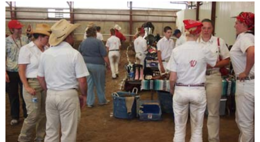
Shoppers and sellers mingle at the 2012 Tack Swap.