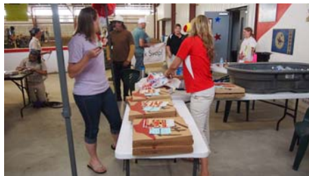
The Alumni Association served pizza and refreshments to attendees.